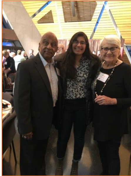
Frances McHie Nursing Scholarship winner at University of Minnesota McNamara Center