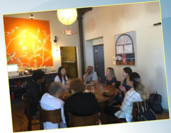
Street Team St. Paul class participants with Hmong Speaker

Our website continues to grow weekly with content and strengthens accessibility to support our classroom service, youth programs and products.