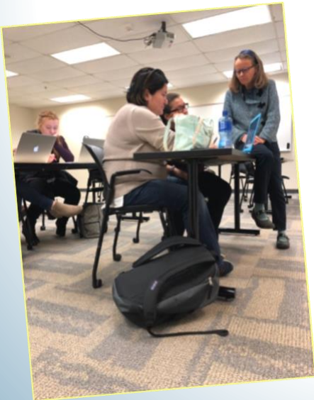
Role Play coaching teacher candidates class